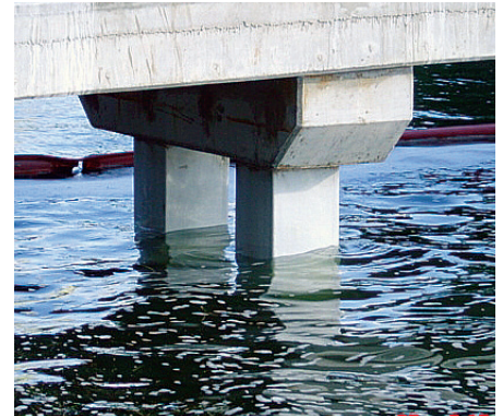
Galvashield Tidal Jacket provides protection to pile section in the tidal zone

The Galvashield Tidal Jacket system is simple to install, and most work can be completed while the structure remains in service. The system requires no maintenance and restores concrete loss due to steel corrosion and concrete spalling in one operation. Galvashield Tidal Jackets can be supplied as round or square jackets with custom lengths suited for the project.