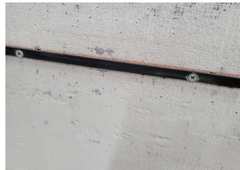
3. Install mounting track

The Galvashield® Surface Mounted DAS can optionally be installed using our Mounting Track kit. If you are not using this kit, skip to step 4b. Install the mounting track along the chalk line, placing it near the center of the desired anode location. Mark the points for the drilled holes for the concrete anchors using the holes on the mounting track. Drill a 6mm (1/4") hole at each mark. Once the holes have been drilled, anchor the mounting track with supplied anchors. Avoid overtightening to prevent deformation of the mounting track.