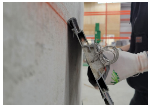
4. Hang anode from track

If the Mounting Track was used, hang the anode onto the mounting track and position it to mark locations for drilling anchor holes. Remove the anode from the mounting track and drill the marked locations with a 6mm (1/4") drill bit.