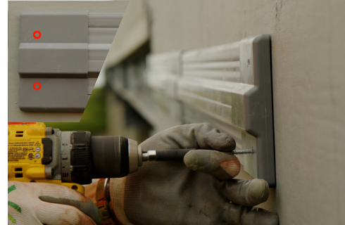
9. Install end caps

End caps are installed over the anode connections by either sliding over the ends or clicking over the top. The cap should cover the steel connection location and the anode-to-steel connection. The cap is then secured in place with two concrete anchors, taking care not to interfere with the anode or steel connections. The cap may be sealed to the concrete surface and the anode surface with caulking or epoxy.