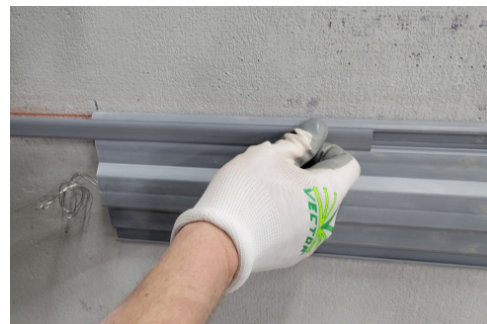
8. Install Cover Strips

Once the anode is firmly anchored, install wiring track cover strips. Strips can be installed by sliding them in from the end, and the curved lip should be toward the outer edge of the anode. Alternatively, it can be placed on the wiring track and tapped into place with a rubber hammer or mallet.