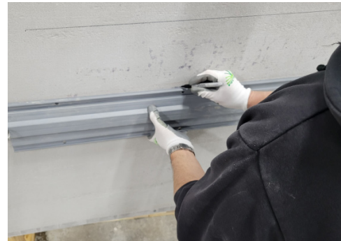
2. Mark top of anode for chalk line

Determine the location for the anode installation and use a chalk line to mark the top line of the anodes. Along the length of the anode installation, use a rebar locating device to find reinforcing steel to make a connection within 100mm (4") of each end of the anode. If you are linking multiple units together, consult the Technical Datasheet or the engineer for steel connection requirements and maximum spacing.