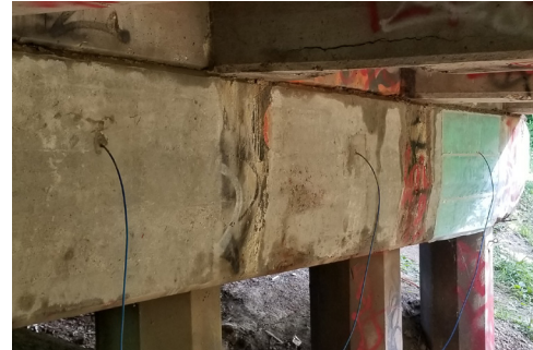
1. Prepare Surface

Before starting the installation, ensure that the concrete surface is clean and even. Complete any necessary concrete repairs, and remove any dirt, loose barriers, or coatings. The surface must not have any relief changes of more than 3mm (1/8"). Blow the surface clean of any dust and blast media with dry compressed air, and vacuum clean if required. Prior to the installation of the anode, the concrete must be wet with water to a point where surface saturated dry conditions are achieved.