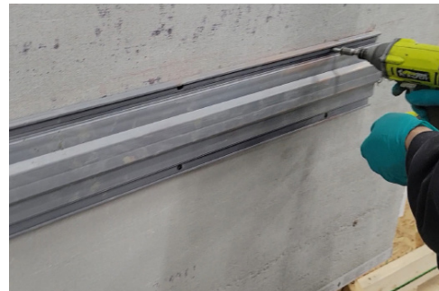
6. Hang and anchor

Saturate concrete surface with water before applying anode. Ensure no standing water. Carefully line up the anode to the drilled anchor holes. The mounting track can be used to help with alignment. Press the anode firmly onto the concrete, allowing mortar to spread out under the anode and eliminating any voids or gaps. Fasten the anode to the concrete using supplied anchors.