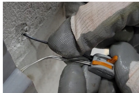
7. Make anode wiring connections

Make connections to steel as per engineer's instructions. Anode wires are connected to the steel connections at both ends of the anode using the wiring connector provided. If the anode connection wire requires insulation stripping, remove insulation to the length specified by the connector. Lift levers fully and place wires into the connector, one wire per connection hole. Fold down the lever and firmly click into the locked position—test the connection by lightly tugging each wire. Encapsulate the entire connection inside of the gel-filled insulation box provided, closing firmly.